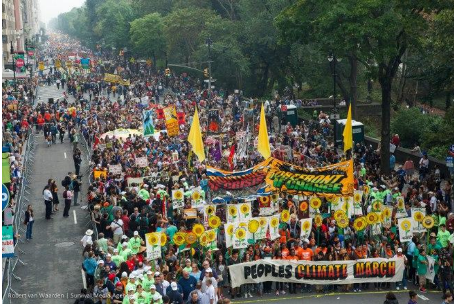
Climate March in New York

For supporting negotiations on climate issues, in autumn 2015 more than 785 000 participants demonstrated at 23000 events in 175 countries within the frame of Climate March.