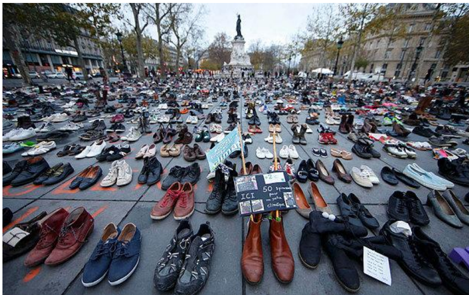
Climate March in Paris

Founder and manager of one of the most notable strategic planning firms, the Bloomberg L.P., Mr Michael R. Bloomberg organized the Climate Summit for Local Leaders parallel with the Paris Climate Summit (November 2015). As mayor of Paris worded: we want to offer good tools for abatement of carbon emission, and also an advantageous healthy and sustainable and thriving lifestyle.” That was the core of the C40 initiative.