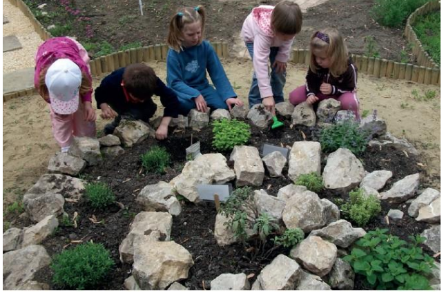
Herb garden in a Green Kindergarten

School gardens are the "heavenly classrooms" of learning, "open-air laboratories". In accordance with the very local conditions, school gardens are usually set up in the courtyard of schools and kindergartens.