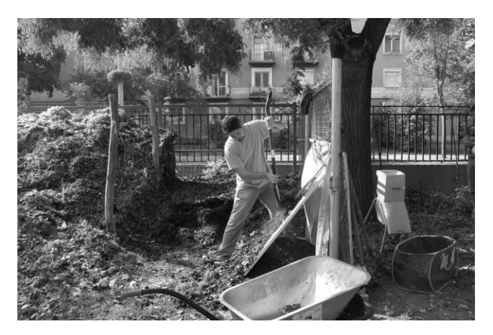
a father drizzling the compost at a school backyard in Budapest

An important outcome of school gardens is that teachers, children, and parents directly interact with each other. Getting known each other also helps other school activities.