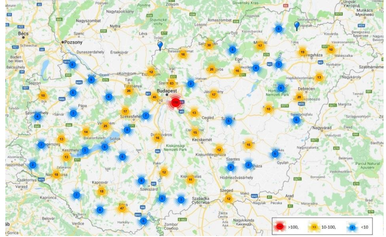
Network of Green Kindergartens in Hungary (with number of Green Kindergartens in the region)

In the program, ecological schools (ökoiskolák <u>https://ofi.hu/okoiskola</u>) and Everlasting Ecological Schools (örökös ökoiskolák <u>http://ofi.hu/hir-kategoria/orokos-okoiskola-cim</u>) are in a favourable position.