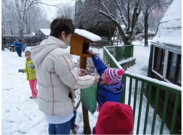
Feeding the birds at a Green Kindergarten

The school garden movement is typically kept alive by some enthusiastic and dedicated teachers. Creating or renovating a school garden and operating it is a great challenge; the source of the tool supply is not completely solved, there is no pedagogical directive with sufficient depth, there is no official status for the theacher who manages the garden.