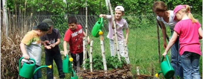
Watering the compost - Regina garden

their natural environment properly and consciously; acquire basic natural science experiences and have the opportunity to practice them in practice, to apply the lessons learned in the courses.