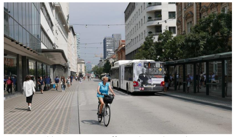
Street in Ljubljana: no car traffic, no lanes, but rules to respect