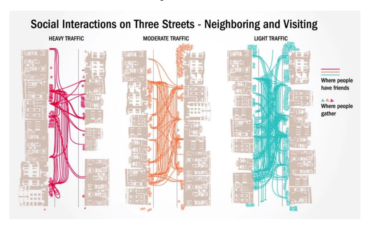
Social interactions on image mapping.

Appleyard was one of the first to use image mapping as a research tool to study the viability of the streets. Residents of the streets surveyed were given a sketch of their street on which they could mark the answers. This allowed Appleyard to gauge residents 'thoughts, feelings and emotions about their home and neighbourhood.