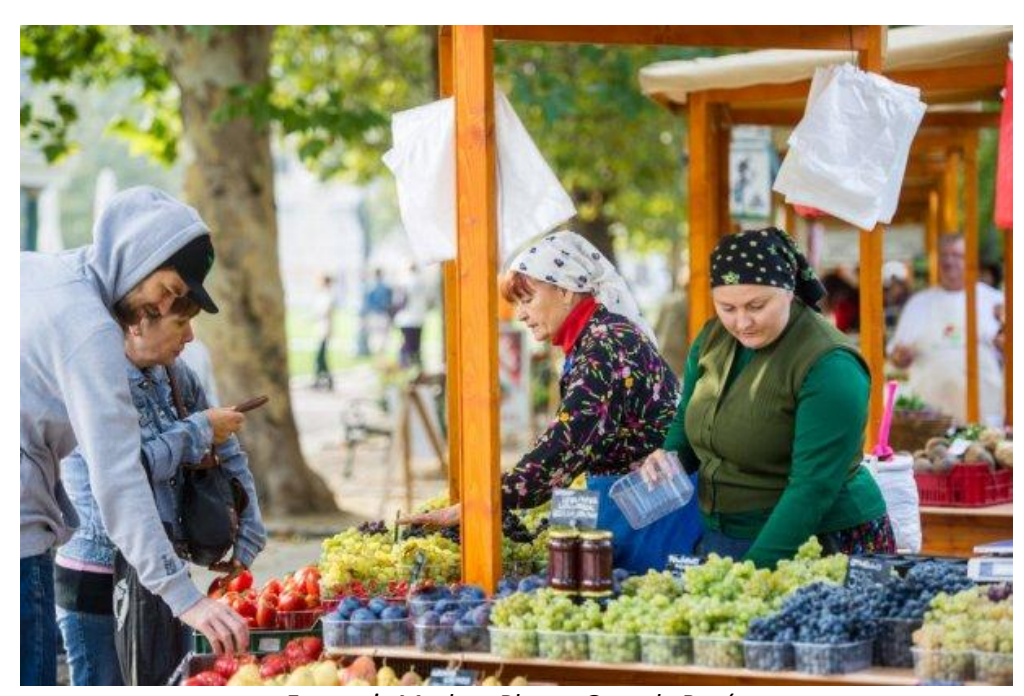
Farmer's Market.